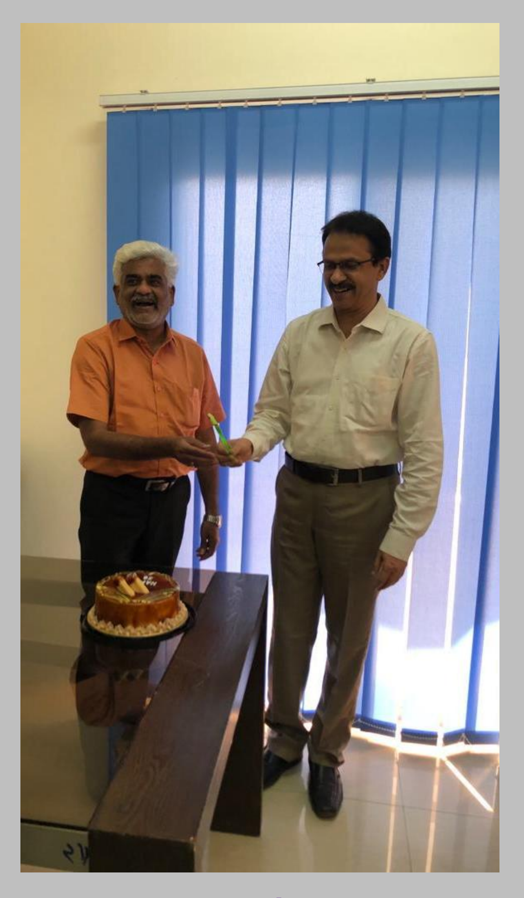
M & S @ 28 – 10<sup>th</sup> October 2021